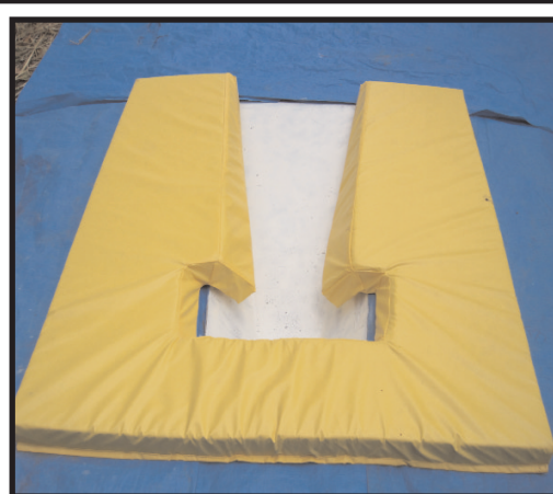
Safetymax Box Collar www.skyjumpers.com