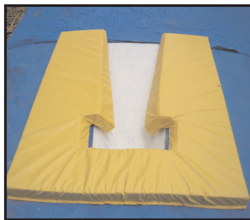
Safetymax Box Collar www.skyjumpers.com